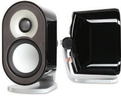
2 speakers with pure-aluminum domes and cones. Adjustable shelf/table stands and tiltable wall-mounting brackets.