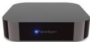
Control box for instant connection to your TV and accessories