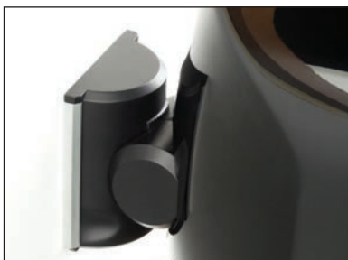
Speakers can be wall-mounted with brackets supplied.