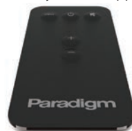
1 remote control with long-life lithium battery