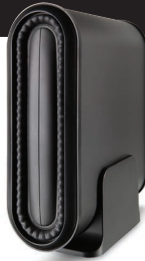
1 subwoofer with removable cradle (can be placed vertically on stand or horizontally on the supplied feet).