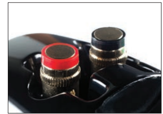
Push-style gold-plated binding posts for easy hook-up.