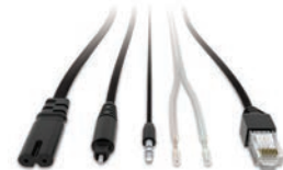
6 cables: 1 x 6' Power, 6' Optical, 3.5-mm, 10' control box, 2 x 15' speaker