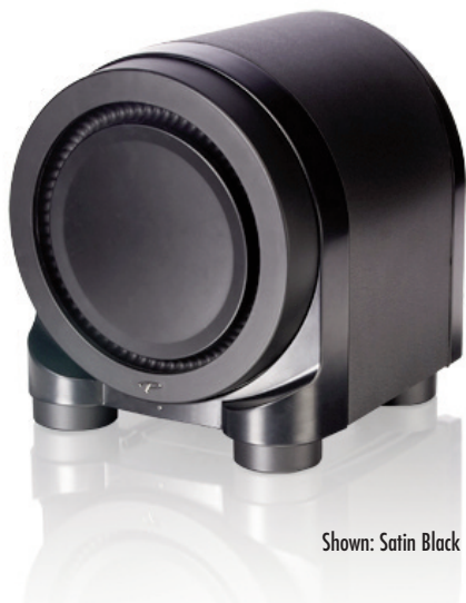
Shown: Satin Black

The Reference Seismic 110 subwoofer isn't a Millenia model, but its unique appearance and small size will make it a “lifestyle” product in the eyes of most, and it's similar in price to the MilleniaSub. A short cylinder lying on its side, it measures only 13.75" W x 13.5" H x 12.6" D. Packed inside its tiny sealed enclosure is a unique 10" driver of mineral-filled copolymer polypropylene, with a Linear Corrugated Surround that permits greater, more linear excursion, and a split voice-coil that runs almost the entire length of the enclosure. The Seismic 110 is finished in satin black and weighs 37 pounds.