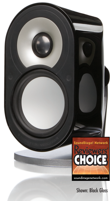
Shown: Black Gloss

to that used in the step-up Paradigm Reference Studio line. The rock-solid enclosure of die-cast aluminum is said to act as a heatsink for the drivers to aid in cooling, and to permit larger, more powerful drivers than would normally be used in such a small speaker. Instead of being oriented at a right angle to the rear panel, the port extends the entire height of the enclosure, starting at the bottom and firing out near the top. This is claimed to extend bass response.